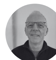
Rocky Wall Founder and CEO, Wink Lighting

“This is definitely one of the best courses that our team has taken. We are now in a position to get up and running with our - long overdue - sustainability plan.”